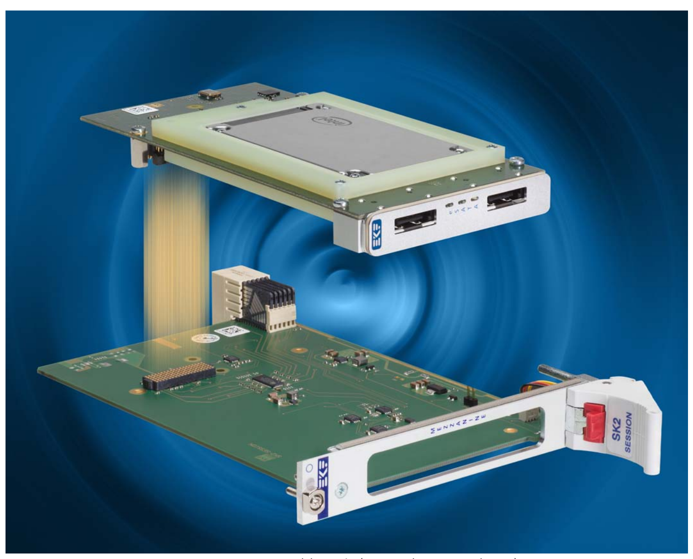
SD7-TRACK Assembly Unit (w. Dual on-Board SSD)